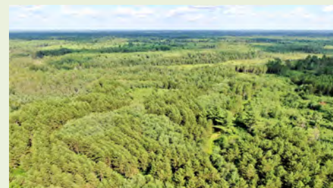
Swamp Lake Road #1 - 40 Acres