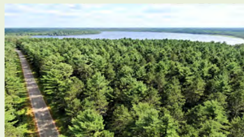
Swamp Lake Road #3 - 17 Acres