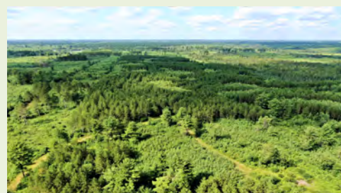
Near Swamp Lake Road - 40 Acres