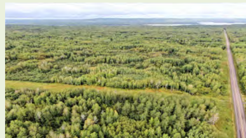
Douglas County - 150 Acres Nearby!