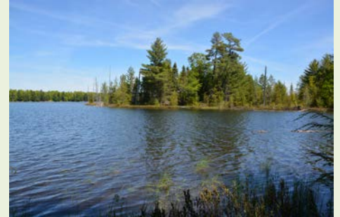
Buckeye Lake South