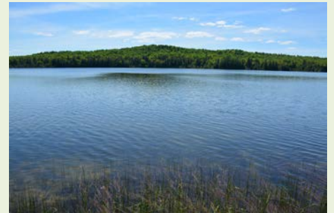
Buckeye Lake North