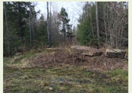
Sand River Area