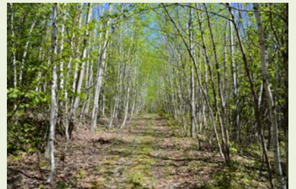
Marquette County CL